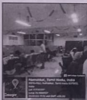
Computer Science Lab