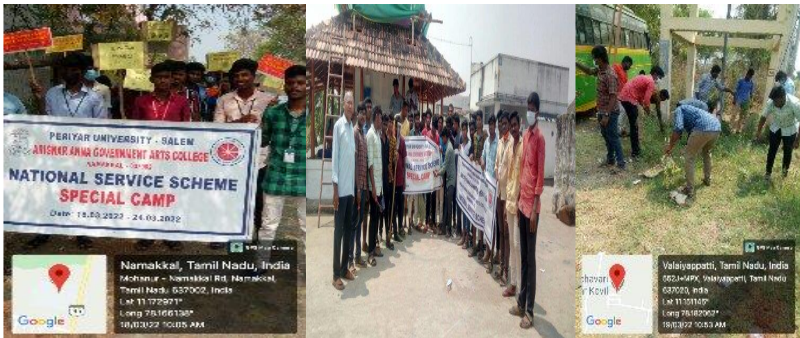
The volunteers attempted to create awareness on cleanliness and hygiene in the village.