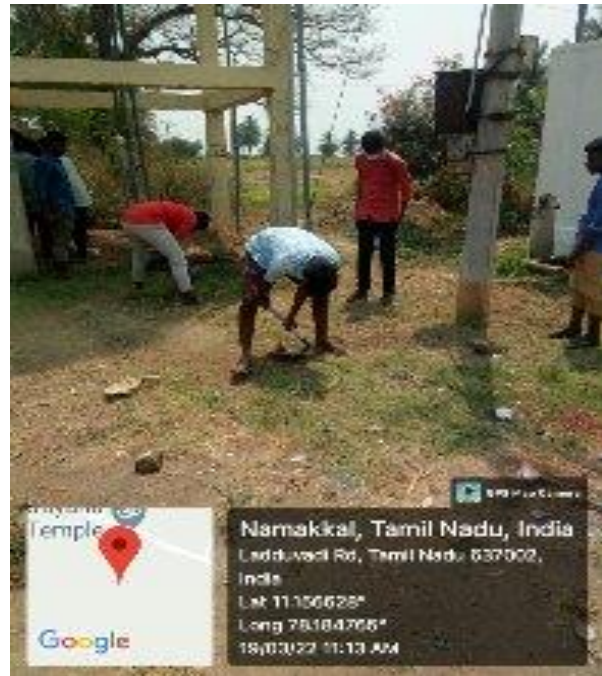
Volunteers are cleaning the garbage surrounding the street (left); they clean also near the water tank (right)