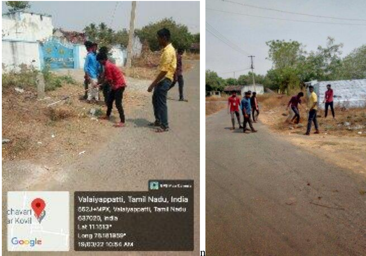
The Volunteers are removing garbage and plastic bags in the road side of the village.