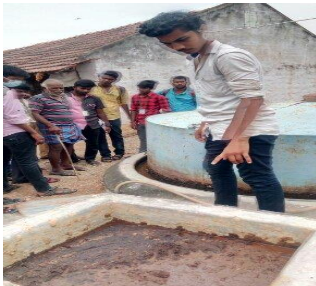
Poultry manure cum biogas plant visit on 20-03-2022